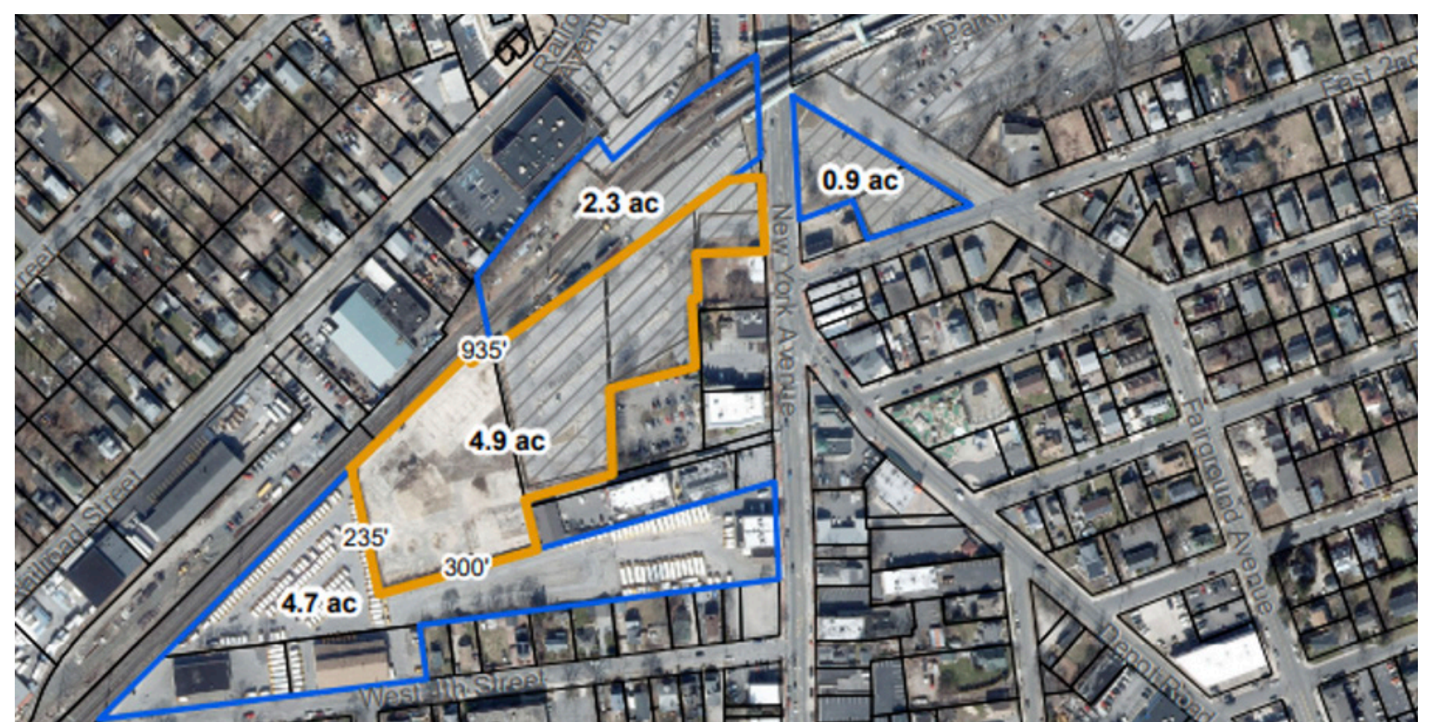
Conceptual Site Plan